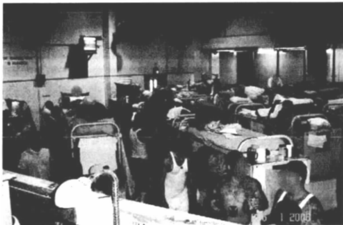
Mule Creek State Prison Aug. 1, 2008