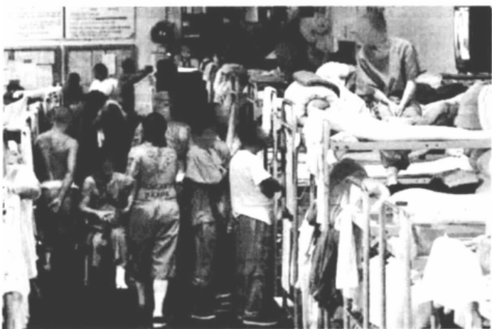
California Institution for Men Aug. 7, 2006